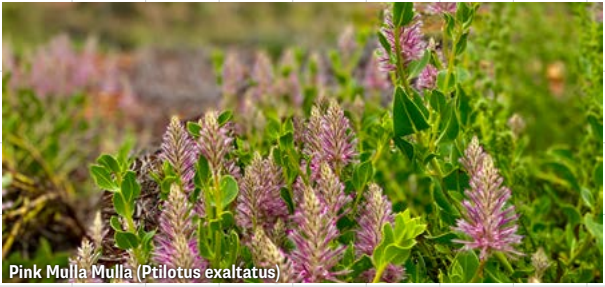
Pink Mulla Mulla ( Ptilotus exaltatus )