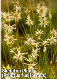
Skeleton Plant ( Ptilotus fusiformis )