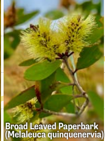
Broad Leaved Paperbark ( Melaleuca quinquenervia )

Base map and data © Custom Mapping Services, 2022 www.custommapping.com.au