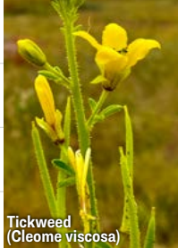
Tickweed ( Cleome viscosa )