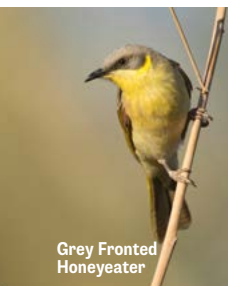
Grey Fronted Honeyeater

Sand Goanna - Black-headed Goanna - Fairy Martins - Zebra Finches - Painted Finches - Spinifex - Native Rock Fig