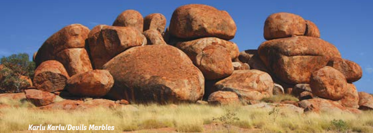
Karlu Karlu/Devils Marbles